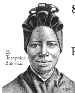
St. Josephine Bakhita

7 th Feb: St Mel, patron saint of the Diocese of Ardagh, Co. Longford